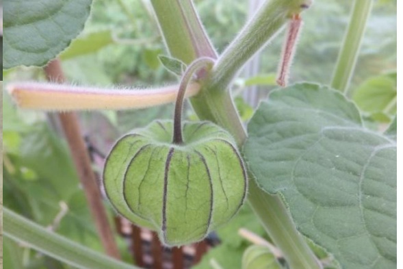
Some of the more unusual fruit and vegetables grown on the allotment this year. Cape Gooseberry, Ogden Mellon and Sweet Potatoes.